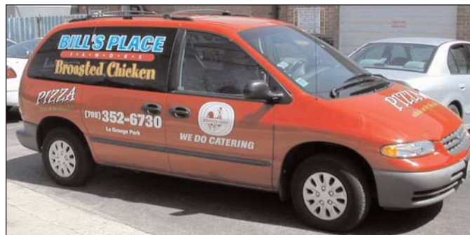
Bright and colorful, the Bill's Place delivery van draws attention wherever it goes!

The attention to detail and pride shows. Bill's Place serves over 300 guests on any given weekday and over 500 guests on a typical weekend day. While about 40% of their business is from carry-out, catering is also a big part of their business. It's not uncommon for Bill's to get an order for 100 to 200 pieces of Genuine Broaster Chicken® with Broaster® Potatoes. They have a nice take-out menu, a separate menu just for catering clientele, and a delivery van that not only delivers but advertises their catering as well.