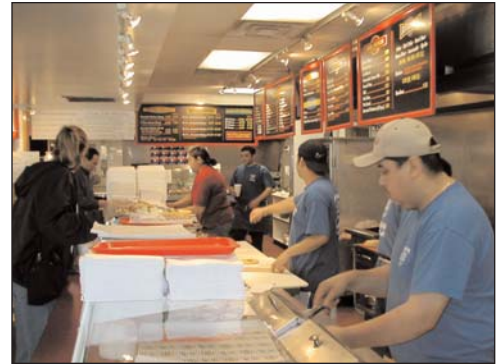
From the clean exterior of the building to the impeccable food line inside, pride and quality are apparent at Bill's Place in LaGrange Park, Illinois.